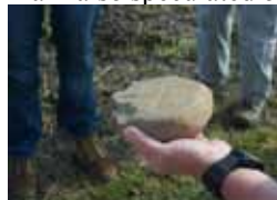
A groundstone artifact found during the survey. This tool would have been used to process wild plants or pigments.