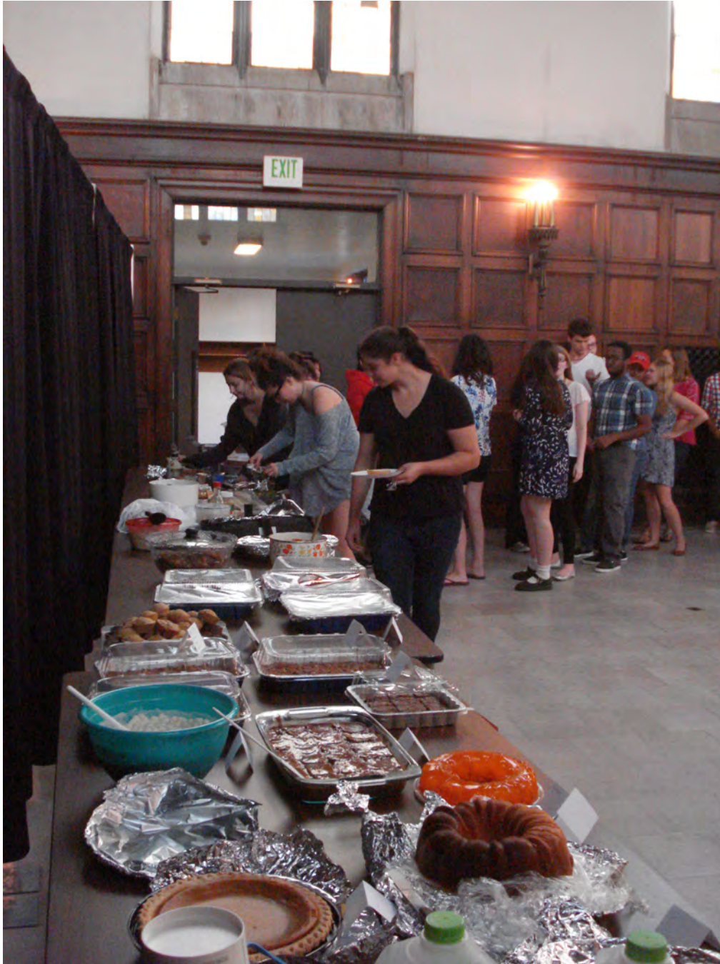
Students from the Anthropology 104 course enjoy "Food of our People" feast in Main Dining Hall.