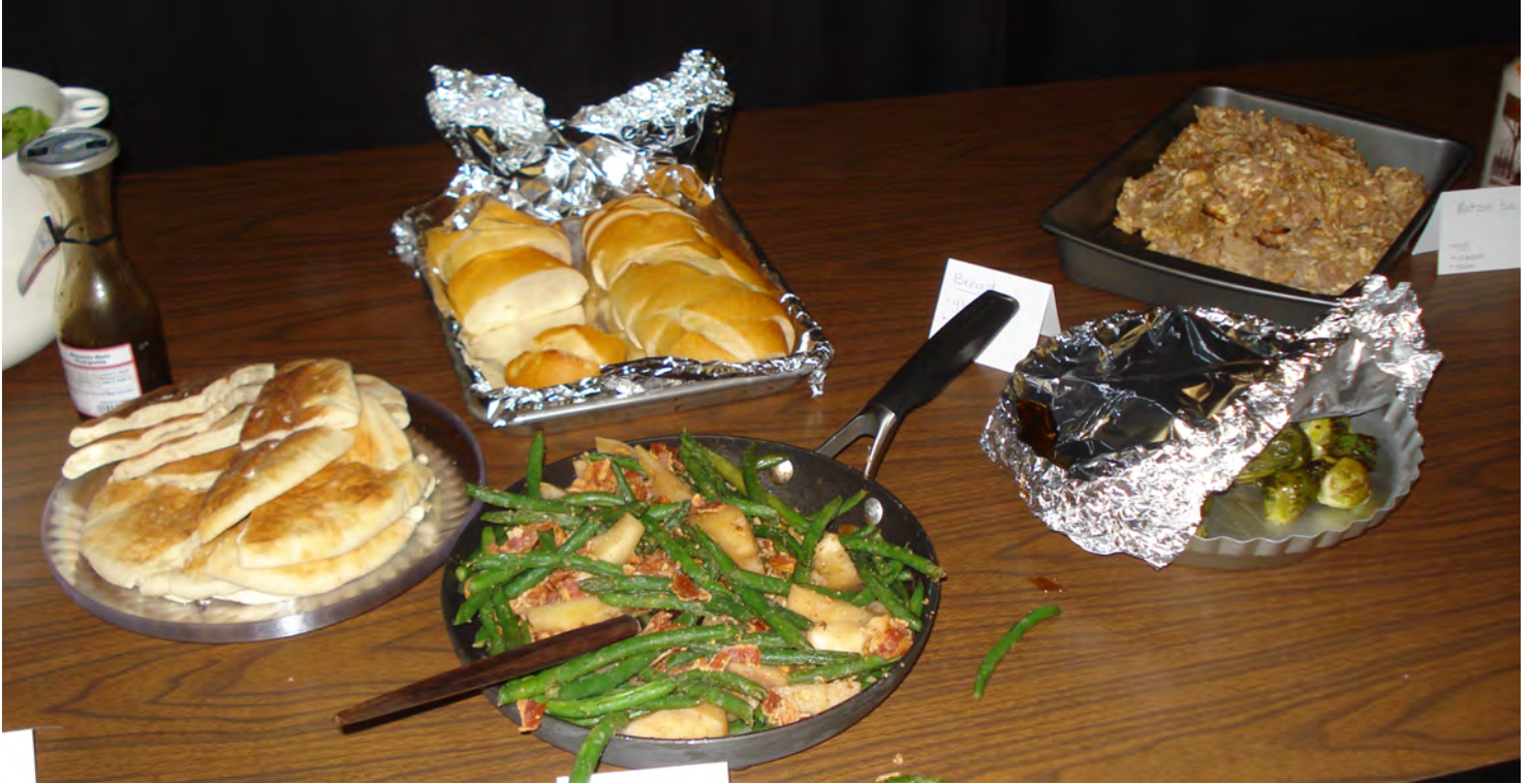
Some of the great tasting food at the “Food of our People” pot luck