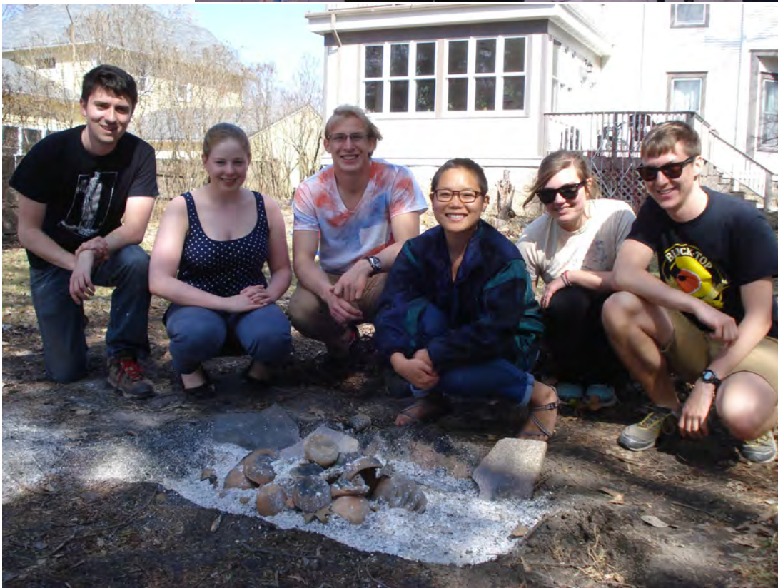
Archaeological Field Methods class firing pottery: