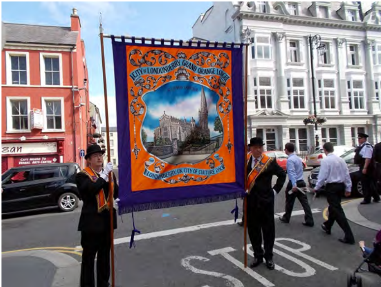
The Marching season in Northern Ireland.