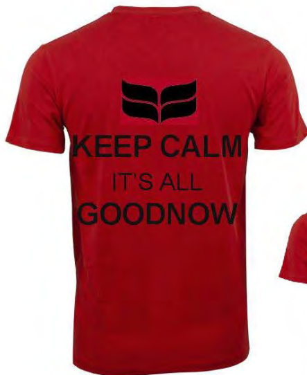
2014 Anthropology t-shirts