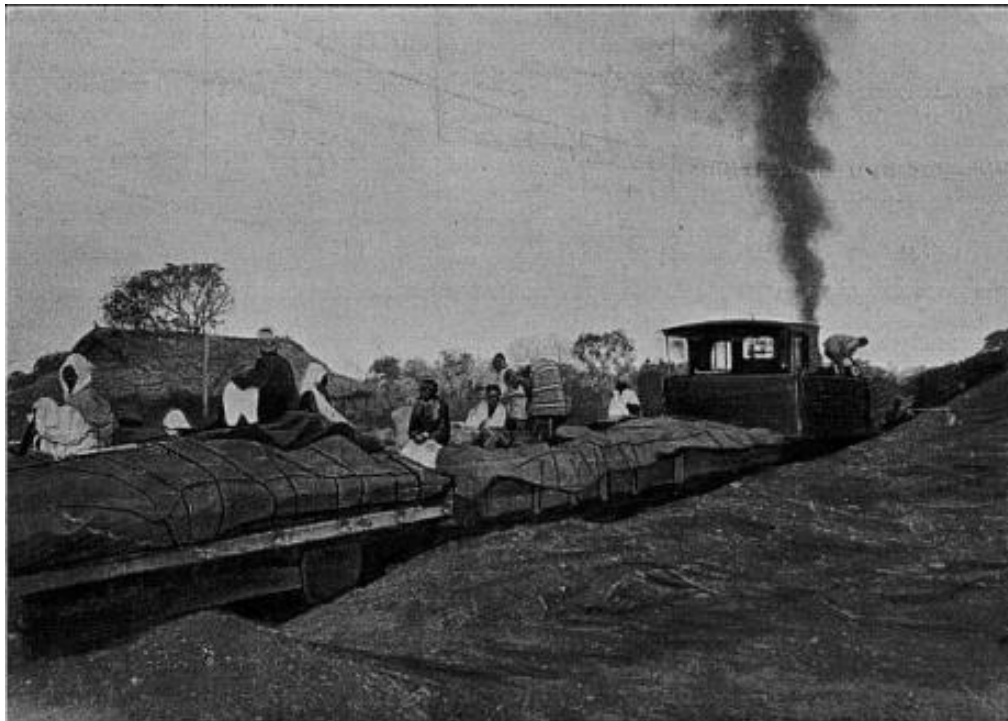
The 1947-48 French West African Railway Strike

This class, like many others, is happening in a larger context of uncertainty, stress, frustration, and inequality. I will be as sensitive as I can about those constraints and ask that you do the same for me and your classmates, even as we hold each other to the high standards that characterize a Grinnell education. I commit to doing all I can to make this class a meaningful experience for all of its participants, and I thank you for your trust and engagement in the collective process of learning what it means to do history in the midst of an undeniably historical moment.