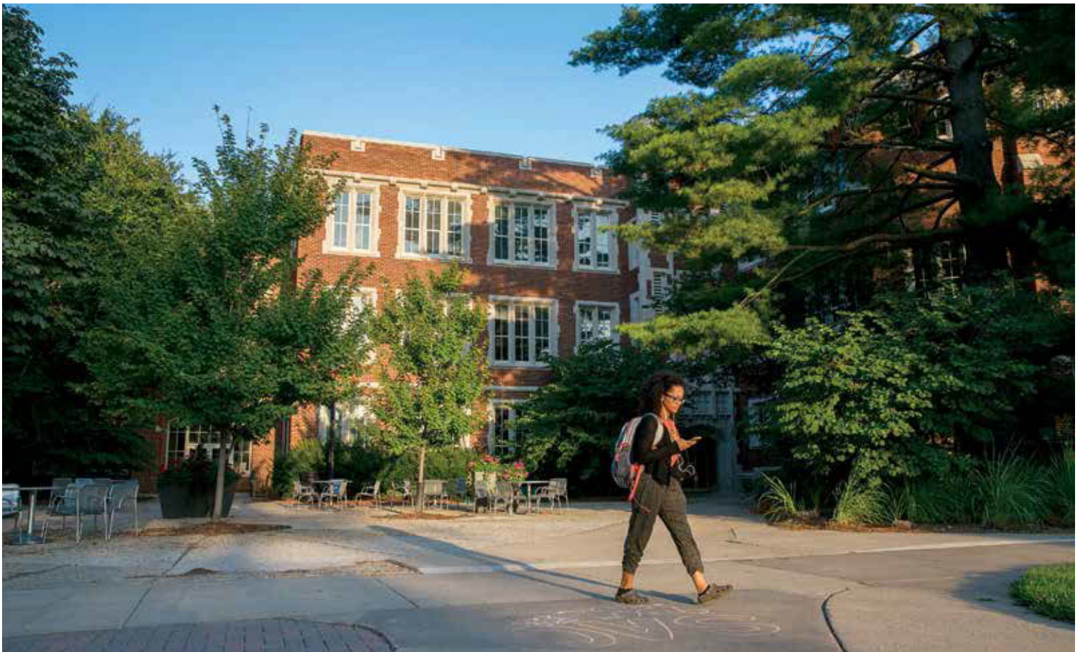
Morning light on ARH.