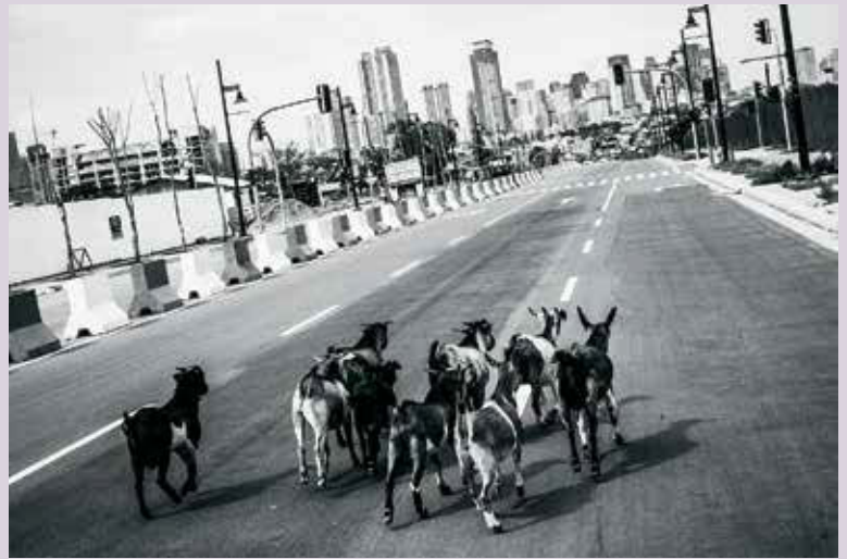
TAGUIG, MANILA: Goats run free in an empty stretch of road on the outskirts of the Bonifacio Global City district, a highly urbanized and planned out community targeting high end corporations, consumers, and residents. These goats were owned by impoverished, informal settlers or squatters who lived in shanties on the periphery.