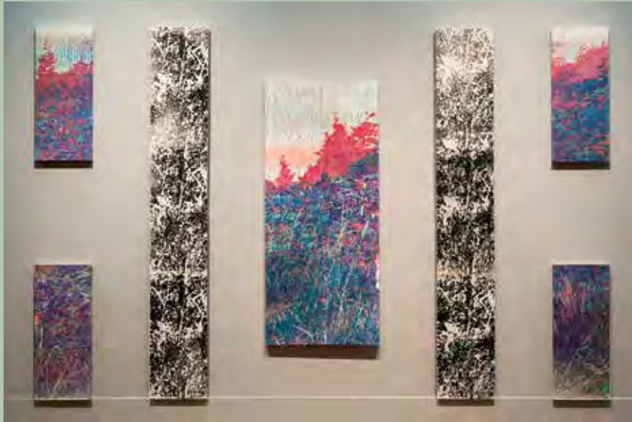
2013 Best in Show Vadim Fainberg '13, C/M/Y/K, 2013 , screenprint on canvas.

The Bachelor of Arts Exhibition features work by third- and fourth-year art students – both art majors and those who have taken a number of art courses while pursuing other majors. Formerly called the Student Salon , this is a professional exhibition of mature student work.