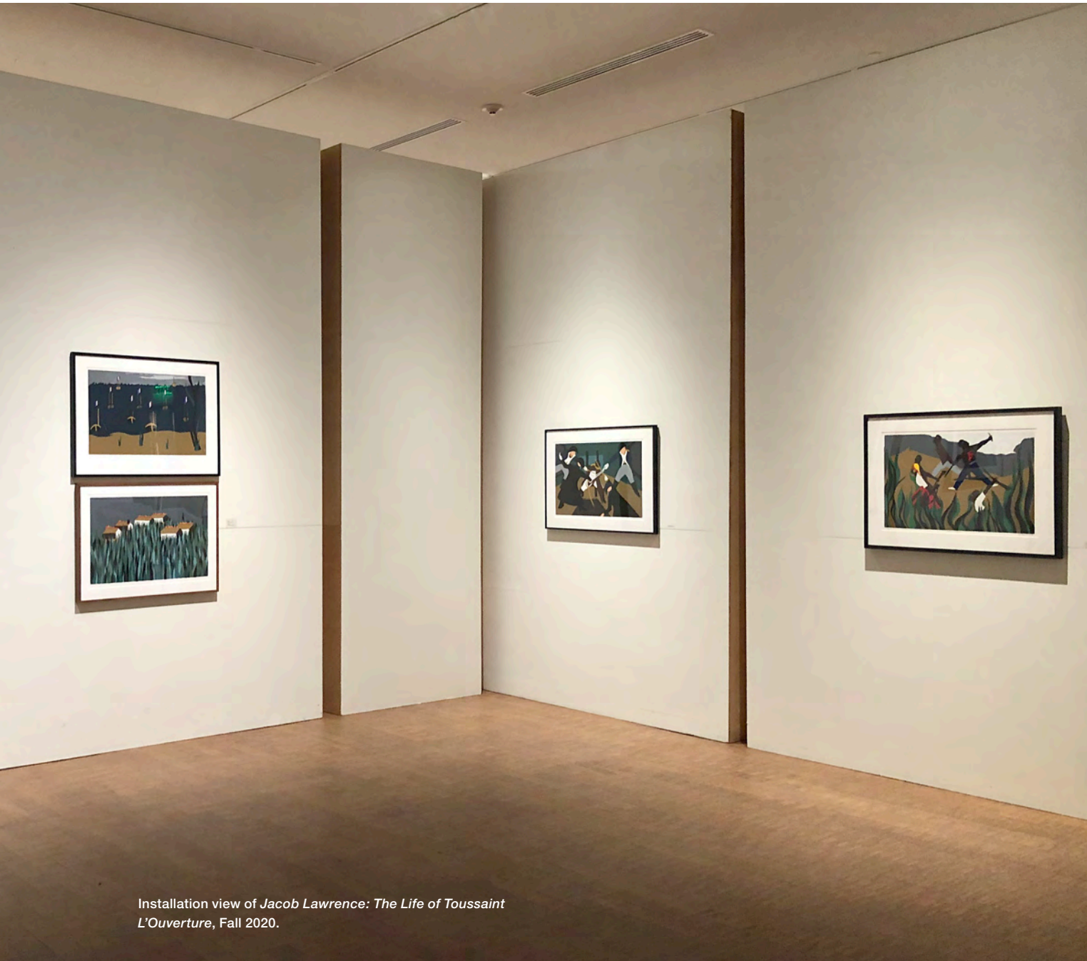
Installation view of Jacob Lawrence: The Life of Toussaint L'Ouverture , Fall 2020.