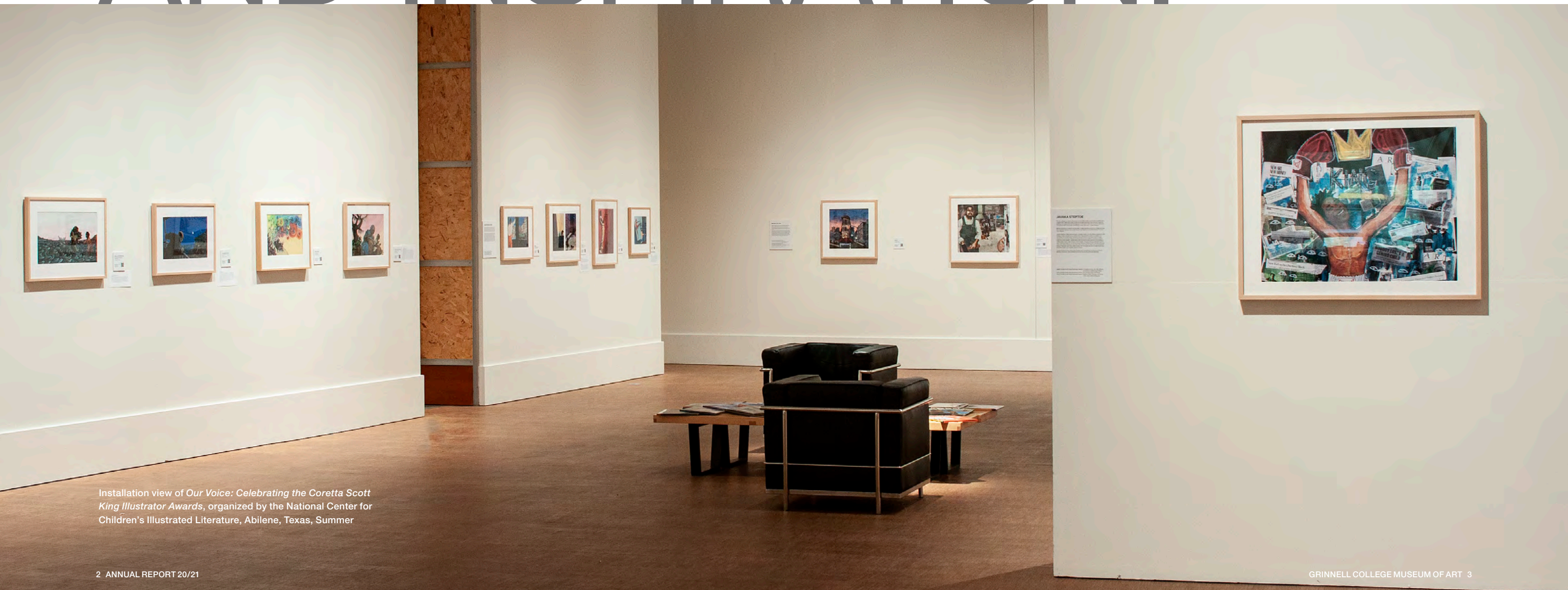
Installation view of Our Voice: Celebrating the Coretta Scott King Illustrator Awards , organized by the National Center for Children's Illustrated Literature, Abilene, Texas, Summer