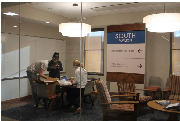
Study in the Anthro Commons